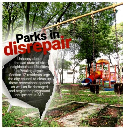
Playground equipment and trees damaged at Jalan 17/14 park which a danger to children and adults alike.