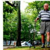
The seven facilities Section 17 in Jalan 17/16, where long-haired, a parent manager. The parent manager is seen talking to a child in the park.

IT IS AN IDEAL PASTIME for many of the 100,000 residents of Section 17, Klang, for enjoying the greenery and recreational spaces scattered in the neighbourhood. However, many residents are unhappy about the sad state of six neighbourhood facilities in Petaling Jaya's Section 17, urging the city council to clean up these recreational spaces as well as fix damaged and neglected playground equipment. Residents of Jalan 17/14, Jalan 17/15, Jalan 17/16, Jalan 17/17, Jalan 17/18 and Jalan 17/19, who live in the six neighbourhood facilities, have written to the city council to urge them to take action to improve the facilities. They also want the council to consider the safety of children and adults who use the facilities. The residents also want the council to consider the safety of children and adults who use the facilities. They also want the council to consider the safety of children and adults who use the facilities.