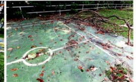
Broken branches and debris from a tree in the playground area is a danger to children and adults alike.