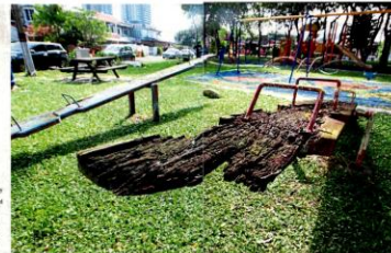
At Jalan 17/15, playground equipment is in a state of disrepair and is a danger to children and adults alike.

This is a popular spot among the residents of Jalan 17/15, Klang, for enjoying the greenery and recreational spaces scattered in the neighbourhood. However, many residents are unhappy about the sad state of six neighbourhood facilities in Petaling Jaya's Section 17, urging the city council to clean up these recreational spaces as well as fix damaged and neglected playground equipment. Residents of Jalan 17/14, Jalan 17/15, Jalan 17/16, Jalan 17/17, Jalan 17/18 and Jalan 17/19, who live in the six neighbourhood facilities, have written to the city council to urge them to take action to improve the facilities. They also want the council to consider the safety of children and adults who use the facilities.