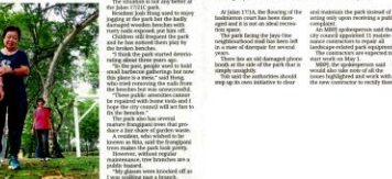
At Jalan 17/14, the playground equipment is in a state of disrepair and is a danger to children and adults alike.

This is a popular spot among the residents of Jalan 17/15, Klang, for enjoying the greenery and recreational spaces scattered in the neighbourhood. However, many residents are unhappy about the sad state of six neighbourhood facilities in Petaling Jaya's Section 17, urging the city council to clean up these recreational spaces as well as fix damaged and neglected playground equipment. Residents of Jalan 17/14, Jalan 17/15, Jalan 17/16, Jalan 17/17, Jalan 17/18 and Jalan 17/19, who live in the six neighbourhood facilities, have written to the city council to urge them to take action to improve the facilities. They also want the council to consider the safety of children and adults who use the facilities.